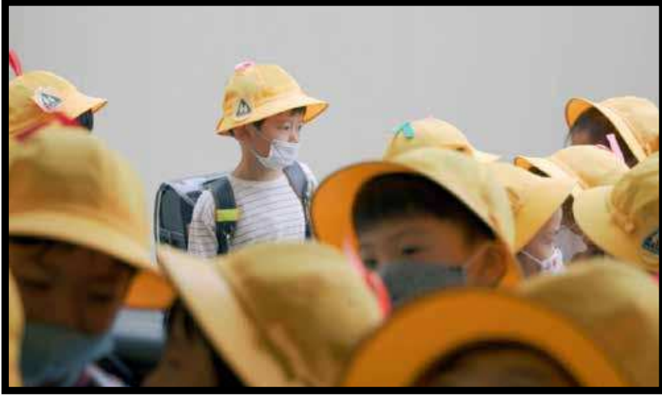
THE MAKING OF A JAPANESE