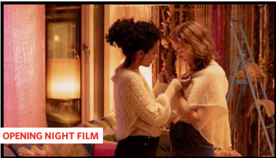
OPENING NIGHT FILM