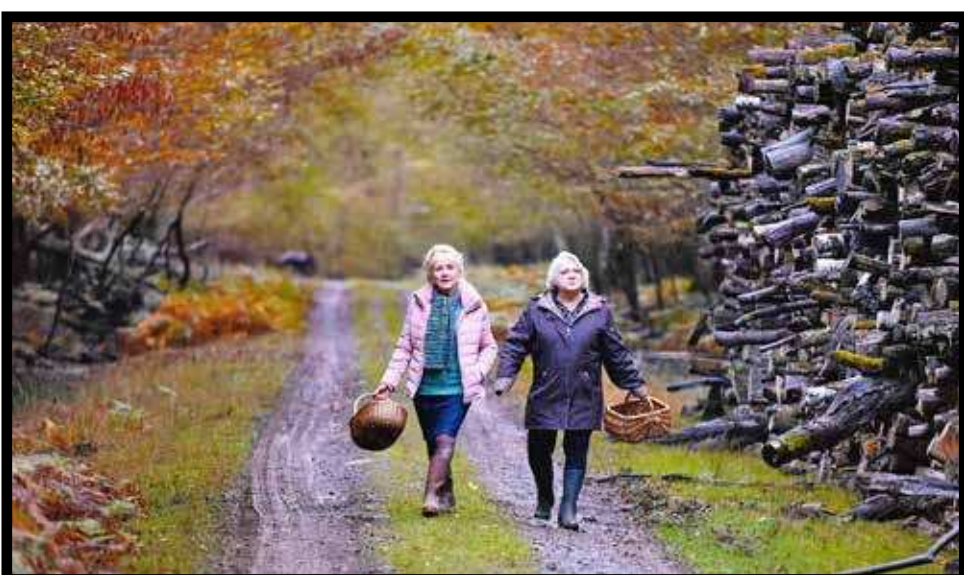
WHEN FALL IS COMING