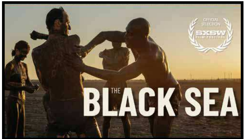
THE BLACK SEA