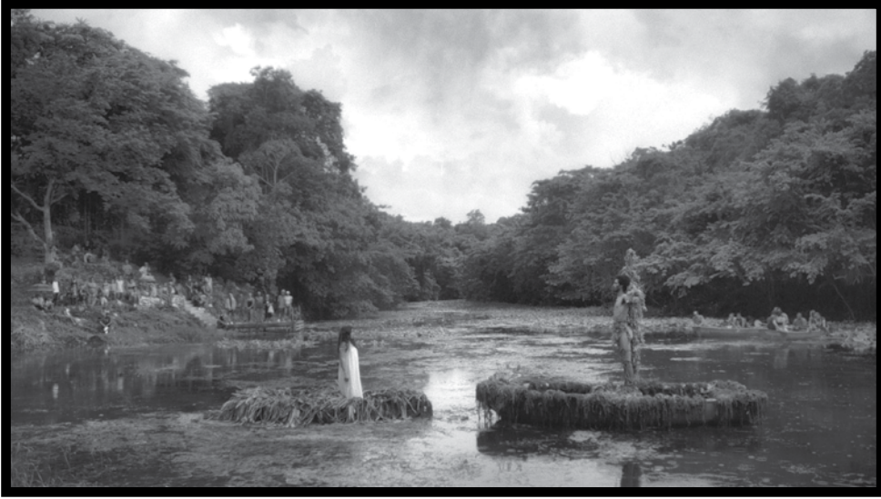
OCEANS ARE THE REAL CONTINENTS