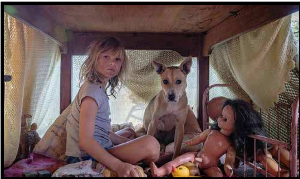
DON'T LET'S GO TO THE DOGS TONIGHT