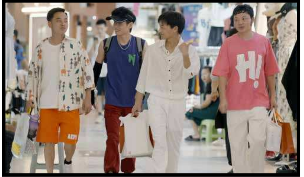
THE DATING GAME