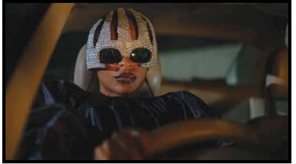
ON BECOMING A GUINEA FOWL